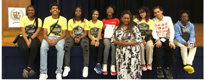
“Dangers of Vaping Forum” - 21CLub@Kendrick High School