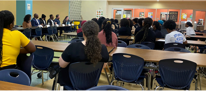
“Turning Hobbies into Careers Forum” 21CLub@DECA

Fulton County, DeKalb County, The Scott Hudgens Family Foundation, Science ATL, Board of Directors and Individual Donors