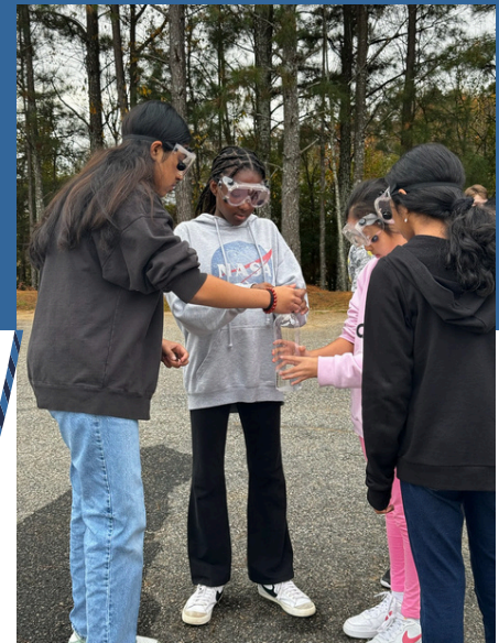
"STEM Workshop Forum" STEM+21CLub@Innovation Academy

# of students participated: 15 # of community members impacted: 120+