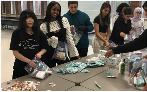
"Hygiene Kits for Unhoused" 21CLub@Midtown