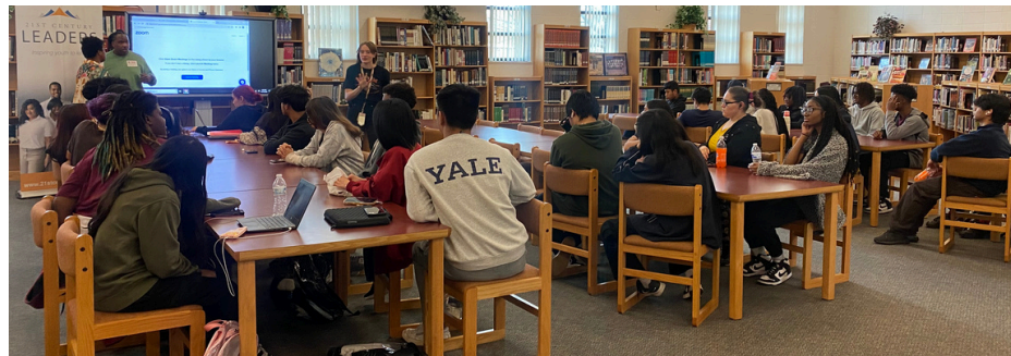
“STEM Career Panel Forum” STEM+21CLub@Forest Park High School